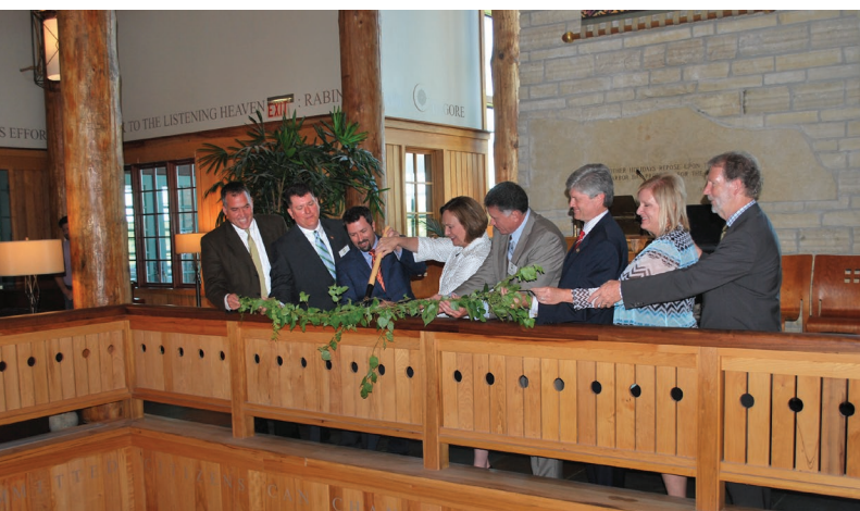
Aug. 13 Vine-Cutting Ceremony at the Lied Lodge & Conference Center

The lodge and conference center remained open during the extensive, $9 million renovation, so guests could see the changes. Guests could also attend meetings about nature and enjoy Arbor Day Farm's hiking trails, orchards and vineyard. On August 13, 2015, Lied Lodge & Conference Center and the Arbor Day Foundation finally celebrated the renewal of an energy efficient location with a Vine-Cutting Ceremony.