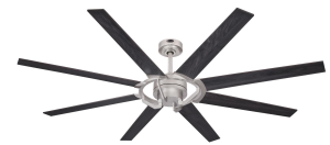
Reversible Wengue Finish Blades