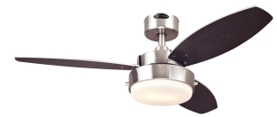
Reversible Wengue Finish Blades