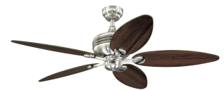
Reversible Weathered Maple Finish Blades