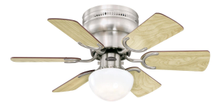
Reversible Light Maple Finish Blades