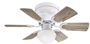
Reversible White Washed Pine Finish Blades