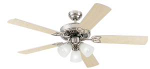
Reversible Light Maple Finish Blades