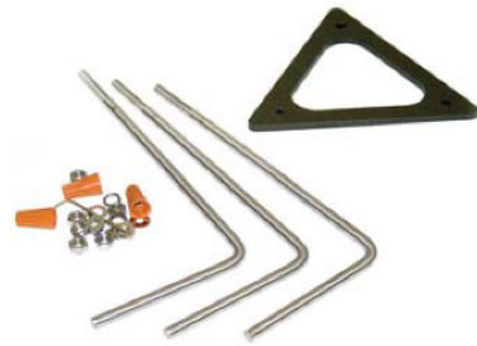
Mounting kit, included contains anchor bolts and mounting template